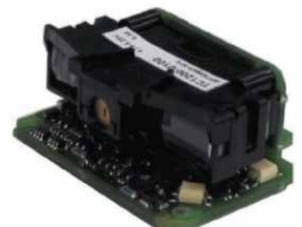
TC1200 SCAN ENGINE MODEL